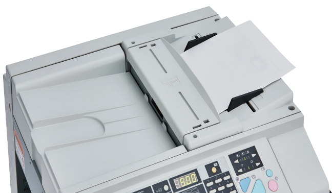
Automatic Document Feeder